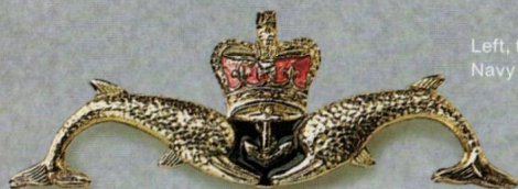
Left, the insignia of the Royal Navy Submarine Service.

The Swiftsure and Vanguard Classes are propelled by nuclear power/steam turbine drive. Swiftsure subs are 81.6m (272ft) long with a displacement of 4900 tons and a complement of 116. Vanguard vessels are 147.3m (492ft) long, displace 15,900 tons and have a complement of 135 (two crews). Life on board a submarine is far from cosy – details of the conditions on HMS Splendid , based on the Clyde, are given in the presentation pack.